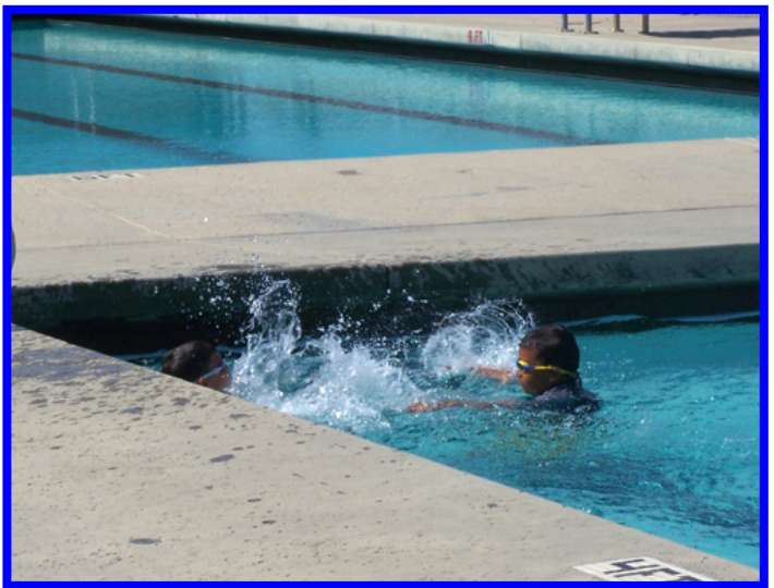
Two boys splash in the Porterville College swimming pool. The boys are campers participating in the PC Pirate Summer Camp, which began June 16 and which will continue until August 15.

The camp's objective is to provide boys and girls, ages 6 to 14, with a learning experience in a safe and structured environment. The program will emphasize participation, sportsmanship, and a cooperative atmosphere in a variety of recreational activities, including: