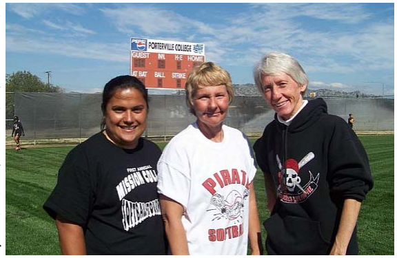
PC Lady Pirate Coaching Staff